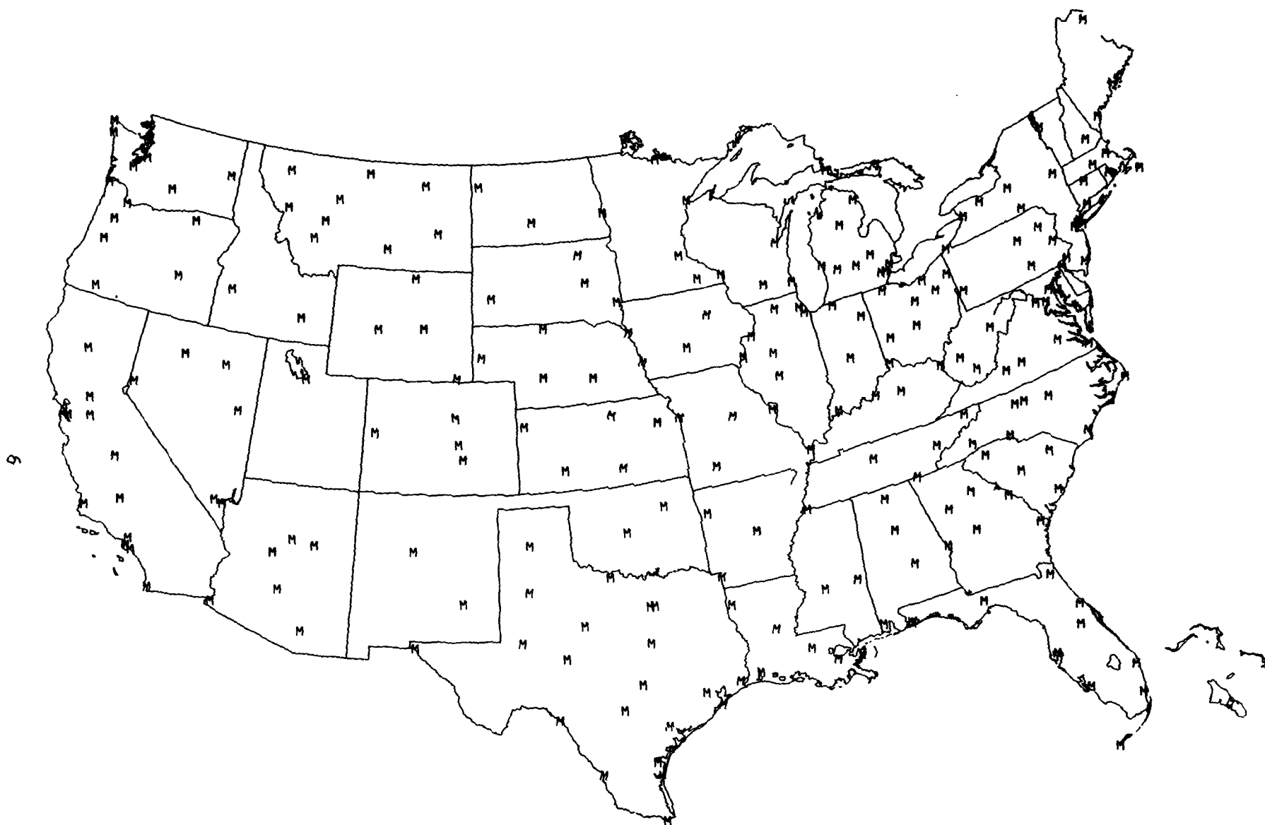
Figure 3. Distribution of weather stations measuring a form of air temperature, humidity, wind movement, and radiation, where evaporation can be estimated by the Penman equation.